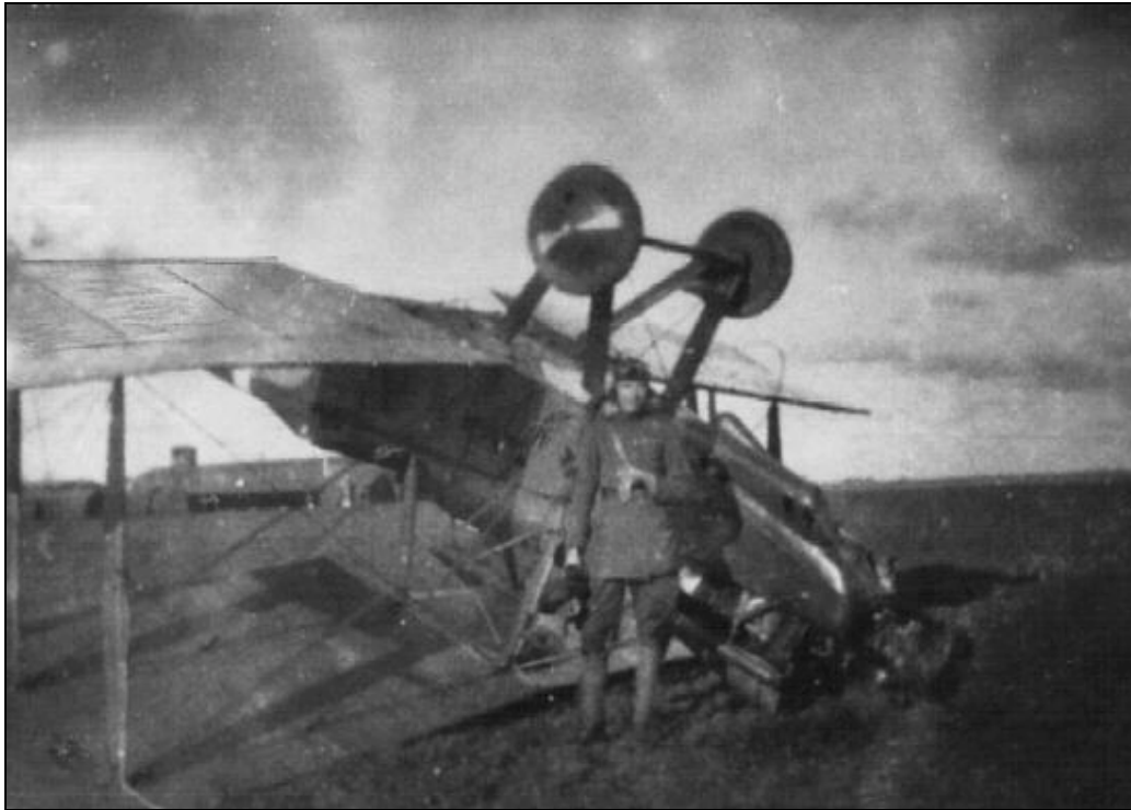
Another RE8 overturned on landing at Harlaxton in 1918.